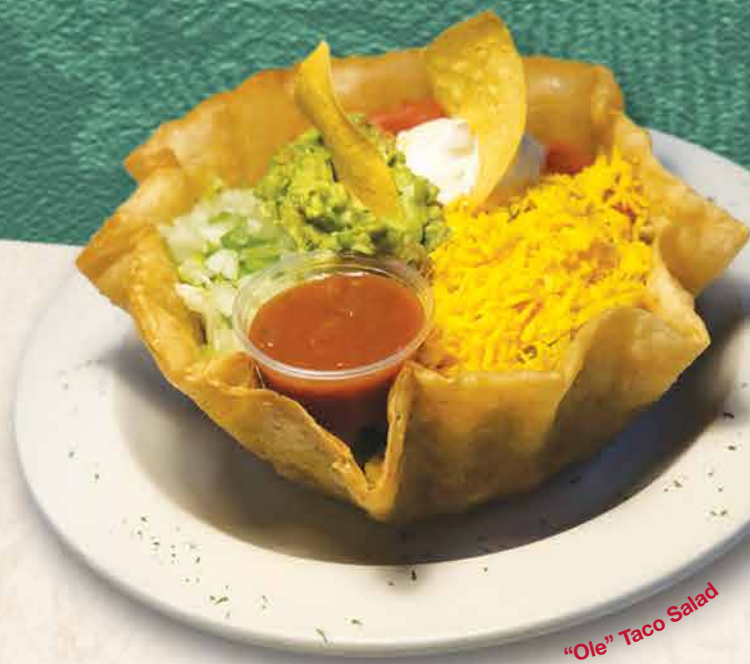
"Ole" Taco Salad