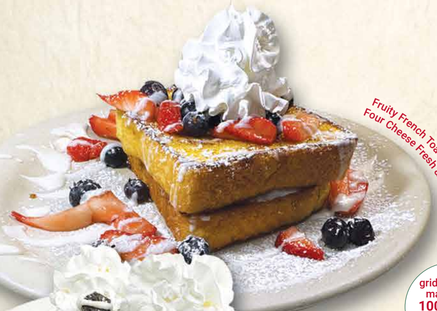
Fruity French Toast Four Cheese Fresh &

Two giant slices of our freshly baked French toast stuffed with our special recipe four cheese blend we use for our crepes. Topped with vanilla icing, then finished with fresh strawberries and blueberries (in season) and lightly dusted with powdered sugar - 16.99