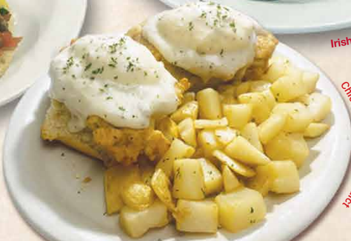
Chicken & Biscuit Benedict

*HEALTH ADVISORY: Consuming raw or undercooked eggs, meats, poultry, or seafood will increase your risk of foodborne illness. Items may contain raw or undercooked ingredients.