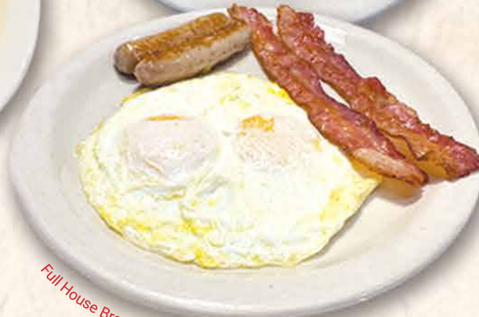
Full House Breakfast