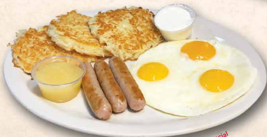
Triple Play Potato Pancake Special

Served with your choice of three buttermilk pancakes or hashbrowns and toast or a muffin - 17.99