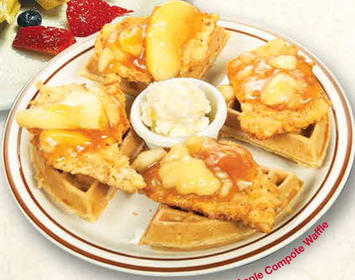
Chicken Apple Compote Waffle