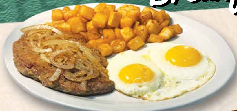
Tennessee Fried Steak with optional chunky breakfast potatoes