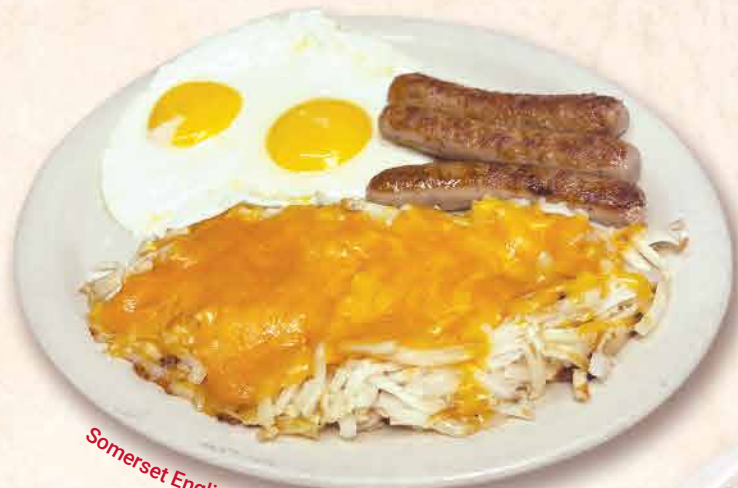
Somerset English Breakfast

Two extra large eggs with ham or three strips of bacon or three sausage links and hashbrowns smothered in sharp cheddar cheese. Served with an English muffin - 16.99