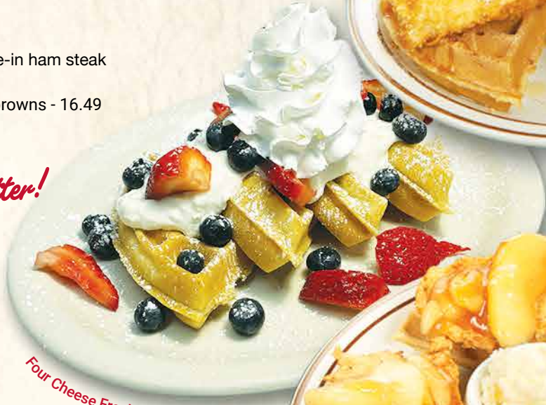
Four Cheese Fresh Fruit Waffle