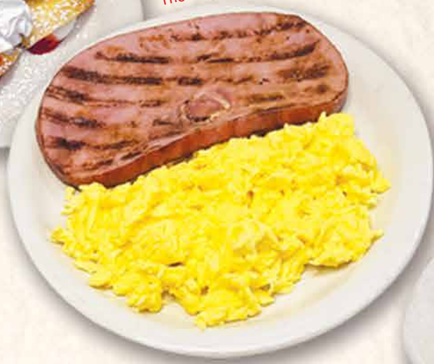
The Crepe Dealer