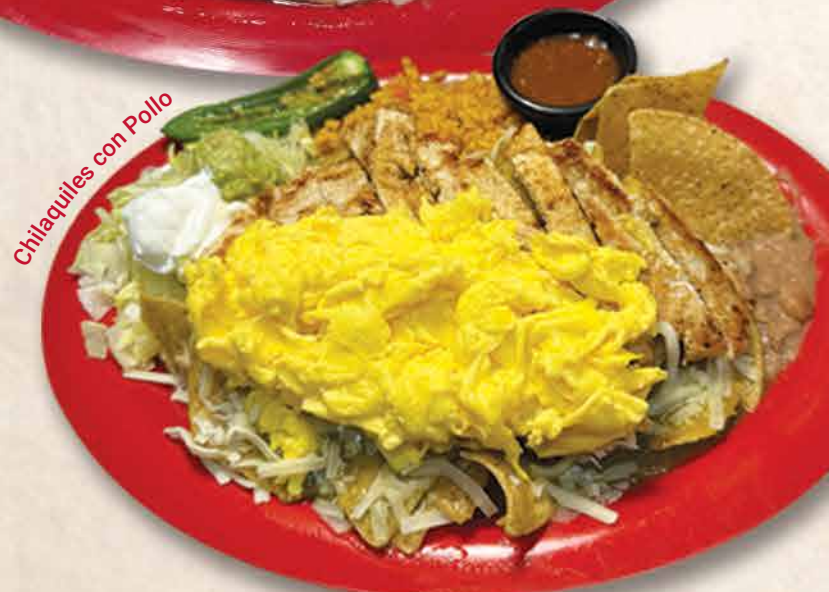
Chilaquiles con Pollo

*These items are cooked to order. Consuming raw or undercooked meats, poultry, shellfish or eggs may increase your risk of foodborne illness.