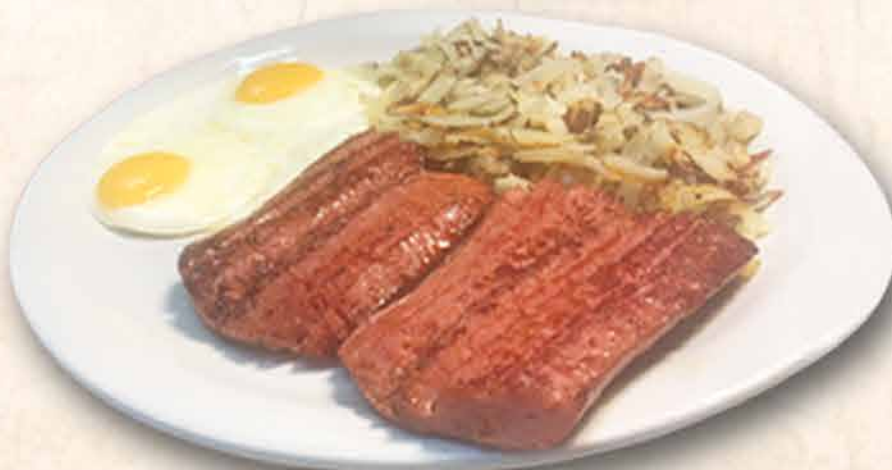
Smoked Sausage & Two Eggs

Certified Angus Beef™ steak served with your choice of three buttermilk pancakes or hashbrowns with toast and jelly or a muffin 6 oz. - 21.99 • 10 oz. - 23.99