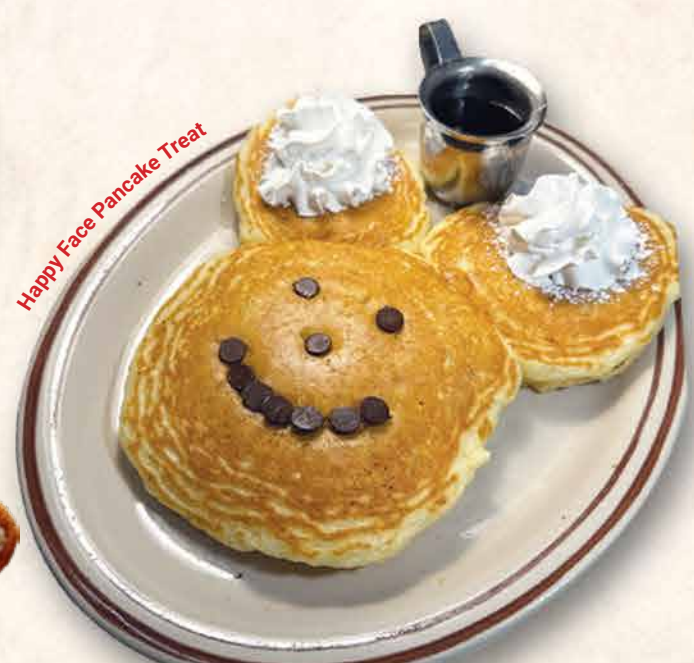
Happy Face Pancake Treat