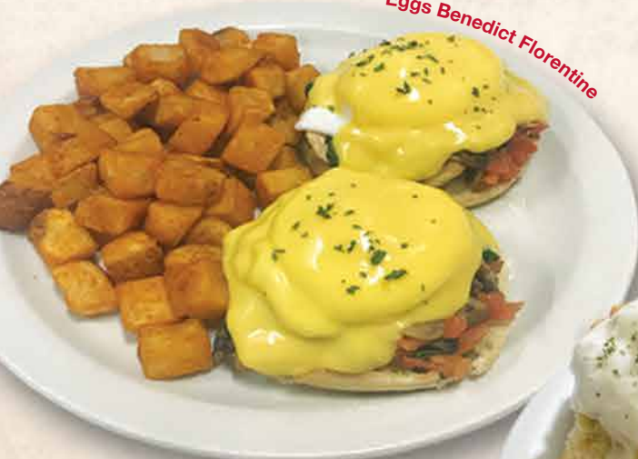
Eggs Benedict Florentine

English muffin halves topped with grilled corned beef hash and sautéed tomatoes topped with two poached eggs and hollandaise sauce. Served with chunky breakfast potatoes or hashbrowns - 16.99