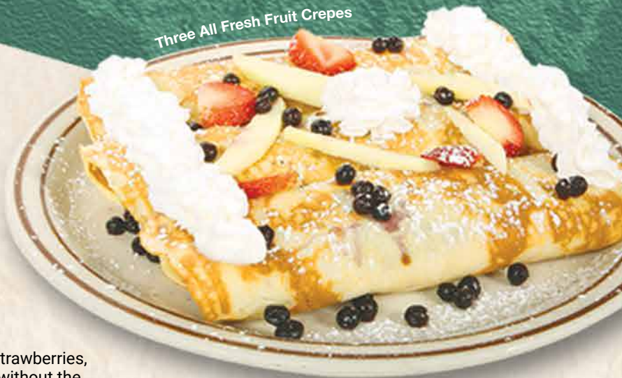
Three All Fresh Fruit Crepes

Three extra large eggs served with two crepes filled with our four cheese blend, homemade fruit compote, then topped with fresh fruit and lightly dusted with powdered sugar. Served with your choice of an 8 oz. bone-in ham steak, four bacon strips or four sausage links - 18.99