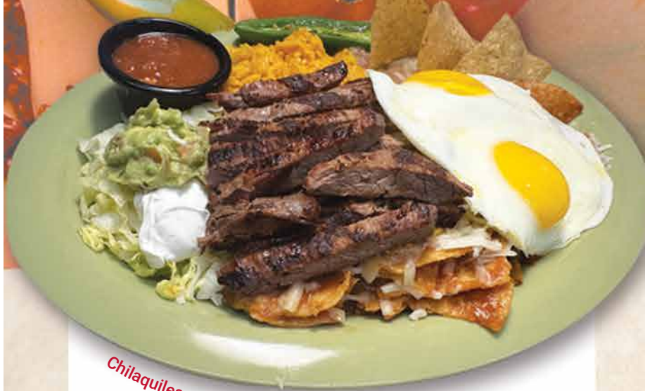
Chilaquiles con Sirloin