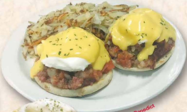
Irish Eggs Benedict