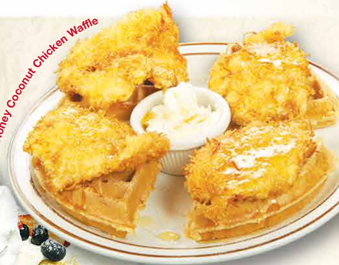
Honey Coconut Chicken Waffle

A 6 oz. tender chicken breast hand-breaded with our Tennessee breading on top of our Belgian waffle and drenched with our warm homemade apple compote - 17.99