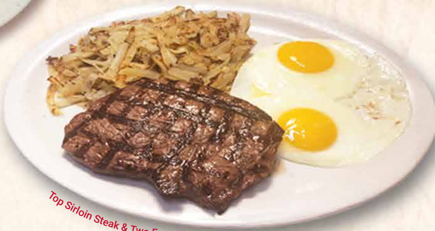
Top Sirloin Steak & Two Eggs

Three extra large eggs served with your choice of an 8 oz. bone-in ham steak or four bacon strips or four sausage links with hashbrowns and your choice of toast or muffin or a homemade fresh daily from scratch biscuit - 16.99